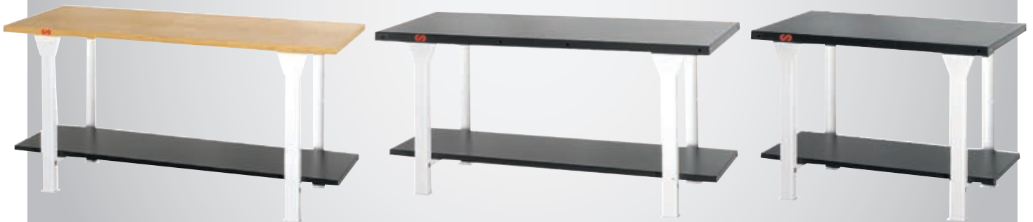
WOODEN TOP WORK BENCH