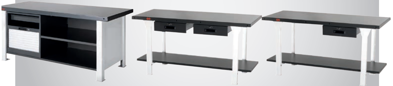
HEAVY DUTY WORK BENCH

Very robust all steel construction and epoxy coated finish. Includes one module with lockable shutter with one drawer, divided in 16 compartments, and one additional module with one shelf with large load capacity.