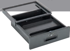
DRAWER FOR WORK BENCH