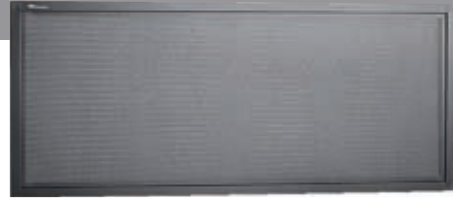
PERFORATED PANELS FOR TOOL ORGANISATION

Perforated panel for fitting hooks and other tool hanging accessories. Strong steel frame with two wall brackets.