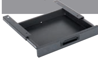
DRAWER FOR SERVICE TROLLEY